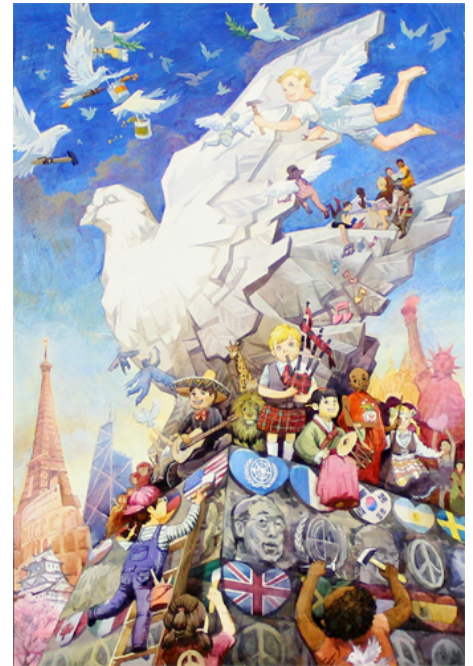
2014-2015 Grand Prize winner

Award applications are available from your club secretary or a district officer.