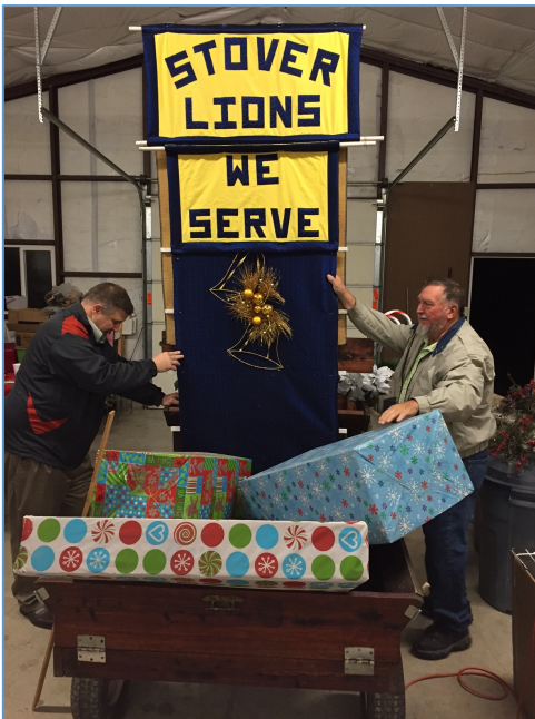
Stover Lions prepare their float for the annual Stover Christmas Parade.