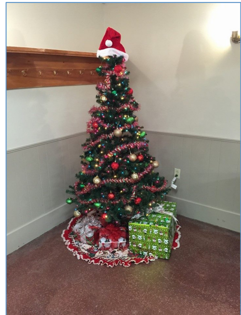
The Holts Summit Lions provide holiday décor in their clubhouse.