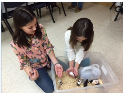
Checking out the “athletes” before the races.

The mice ran wild as the JC Breakfast Lions hosted their annual mouse race. The evening was fun for all ages. The children were able to check out the racers before the event got underway. The club provided hot dog, chips, cookies, pretzels and peanuts in addition to beverages of all kinds. The unpredictable mice made their way over obstacles set up in their lanes and the crowd cheered on their favorites.