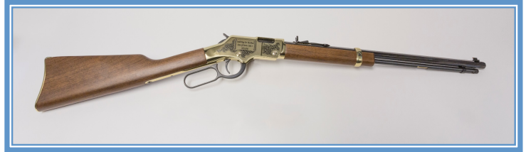
Henry Golden Boy 22LR

The Lions of District 26-M7 are raffling a “Made in the USA” Henry Golden Boy 22LR rifle with two receiver covers: a specially engraved receiver cover and a brass receiver cover for rugged use.