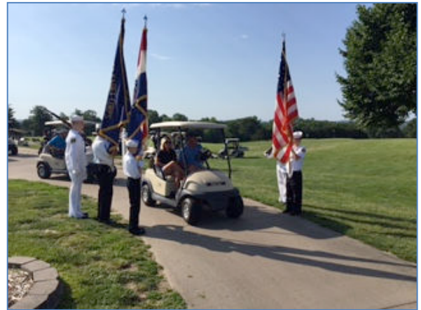
Sea Cadets form an honor guard to kick off the tournament.