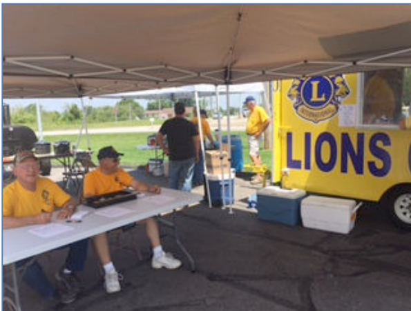
The Brazito-Honey Creek Lions show off their new trailer at their June BBQ sale at Jefferson City's Schulte's Grocery.