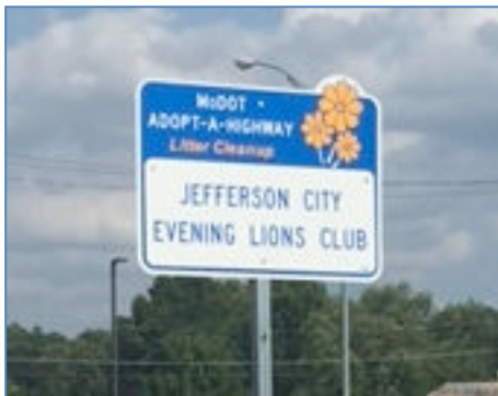
The Jefferson City Evening Lions adopted a stretch of US Business Highway 50. This is one of the busier sections of roads in Jefferson City.