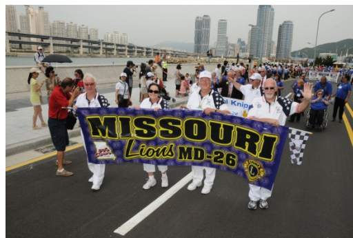
The Missouri Delegation

The leaders from the State of Missouri, all 7 of us, at the graduation banquet.