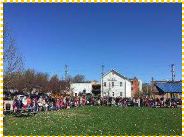
The Crowd Gathers