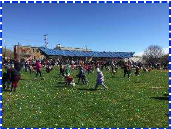
The Hunt Is On