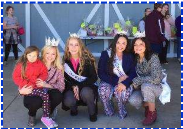
Miss Buchanan and Court and prizes