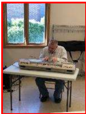
Entertainer Dino Di Augustino