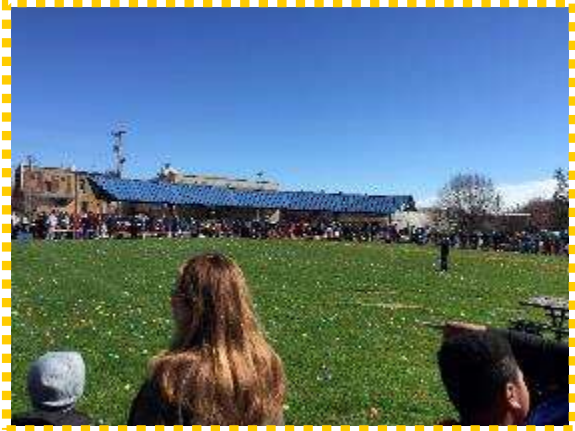
The Field Set With Over 8,000 Eggs