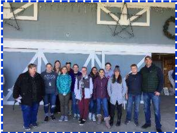
Buchanan Leo's and Advisors

Buchanan Easter Egg Hunt- sponsored by the Buchanan Leo Club- held on 4/20/19