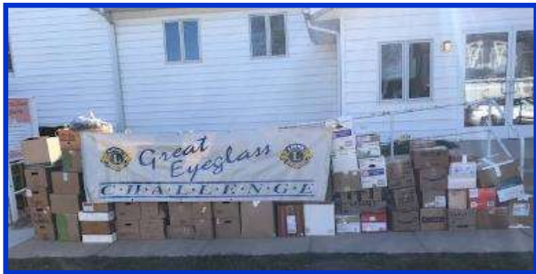
The Mountain of 28,242 glasses” - collected this year