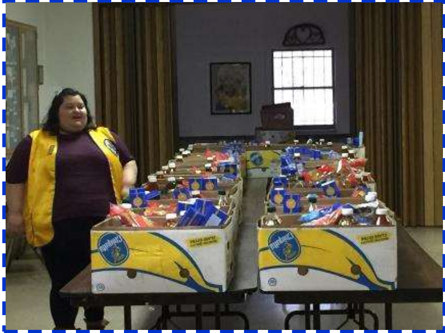
Covert Township Lions prepare food boxes for April 13 th distribution