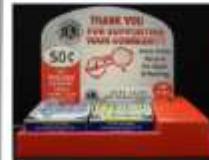
Red Tray Display