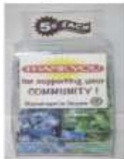
Acrylic Display Mint Drops