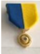
Governor's appreciation medal