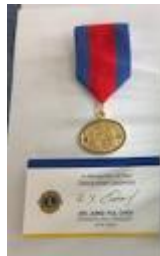
International Leadership medal