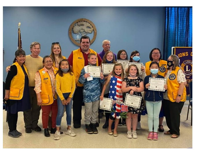
Club members posed with our contestants.