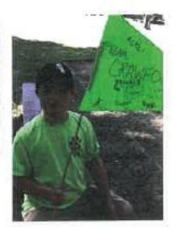
Because of You, my summer was much Brighter! Thank you!