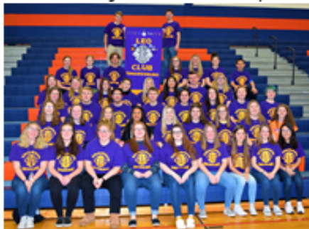
(Not all Leos are pictured here)

The Club is 66 members strong and still more students are coming to join. Collecting service hours is very important for scholarships, college applications and job applications. Students can join the Leos anytime during the school year.