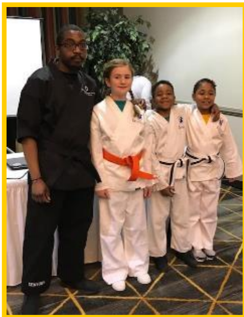
Childhood Cancer kids doing karate at the Forum