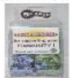
Acrylic Tray Mint Drops