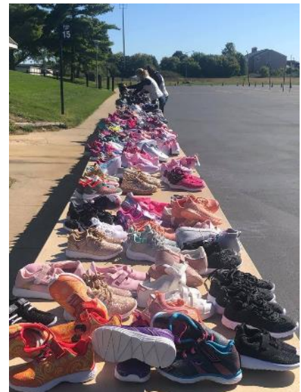
Thousands of shoes to give away