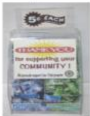
Acrylic Display Mint Drops