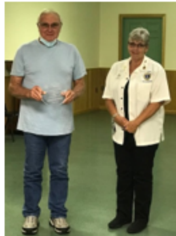
(w/o masks for photo)