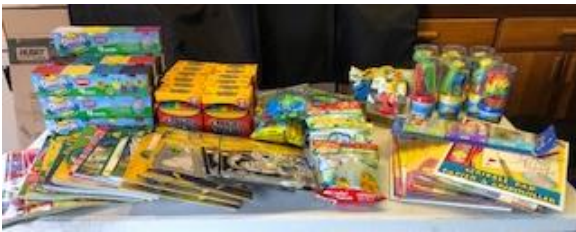
The club donated supplies to the Pediatric Cancer Center at Bronson Hospital