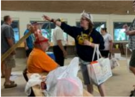
A brave Lion