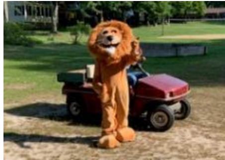
Leo the Lion Arrives!!