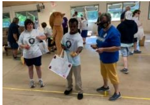
Bean Bag Toss