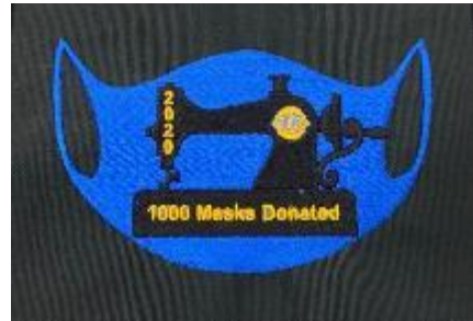
GST Amy created this banner patch