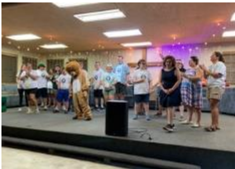
Campers open the show