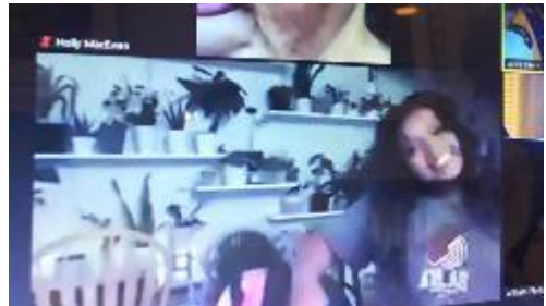
Installation of Tail Twister