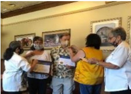
Induction of New Members