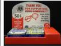
Red Tray Display