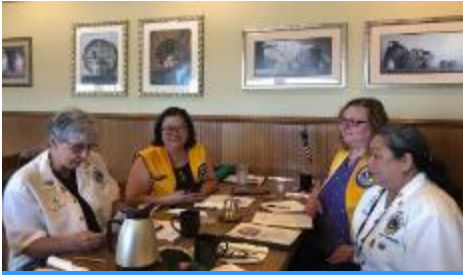
Installation of President, Secretary and Membership Chair