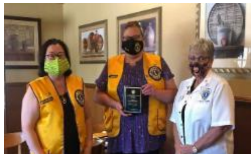
Plaque of Appreciation as Membership Chair