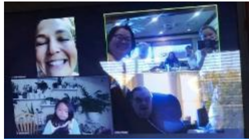
Installation of 1 st and 2 nd Vice Presidents, Treasurer and all Twister