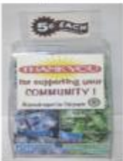
Acrylic Display Mint Drops