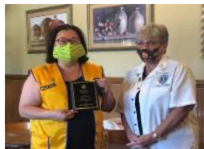
Plaque of Appreciation as President