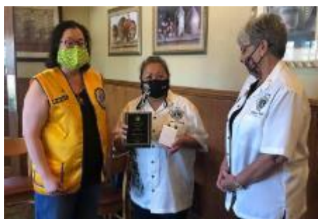
Plaque of Appreciation as Secretary