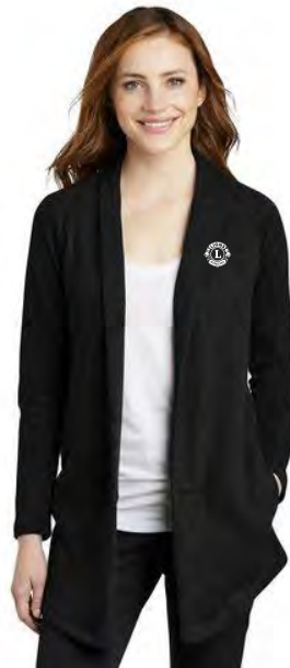
Deep Black Heather