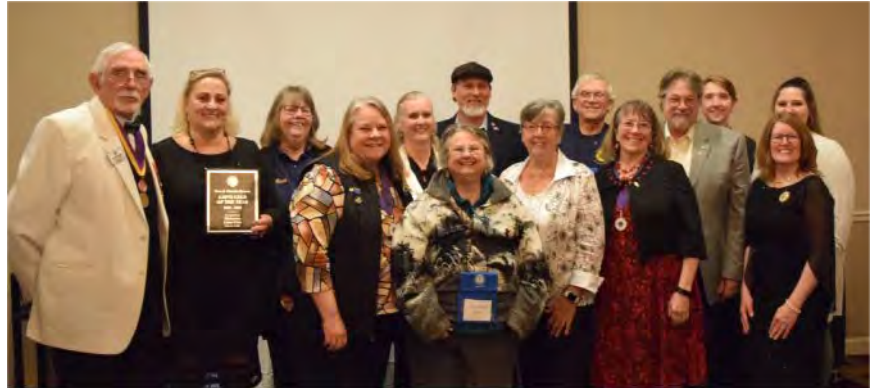
Mattawan Lions Club receiving Lions Club of the Year Award