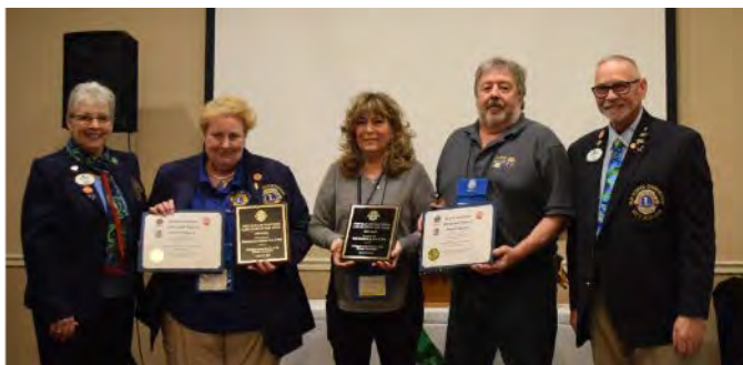
LEO Club of the Year award co-winners, Buchanan-Galien and Edwardsburg.