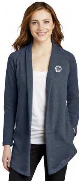
Estate Blue Heather