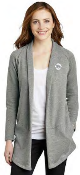
Medium Heather Gray

We will be adding a small, white Lions logo to the upper left side.