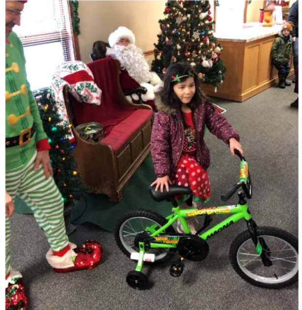
Santa comes through by giving a bicycle to the first child who said they would like a new bike for Christmas.