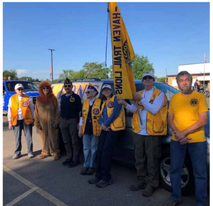
The Kal Haven Lions were the lead marching unit in both the Gobles and Bloomingdale memorial day parades.