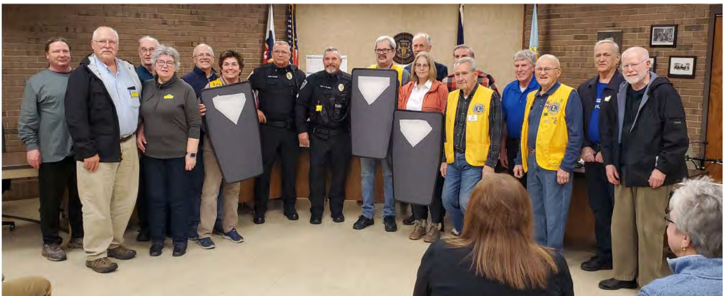
Members of the Lakeshore Lions Club pose with ballistic shields Tuesday, which they donated to the Lincoln Township Police Department.