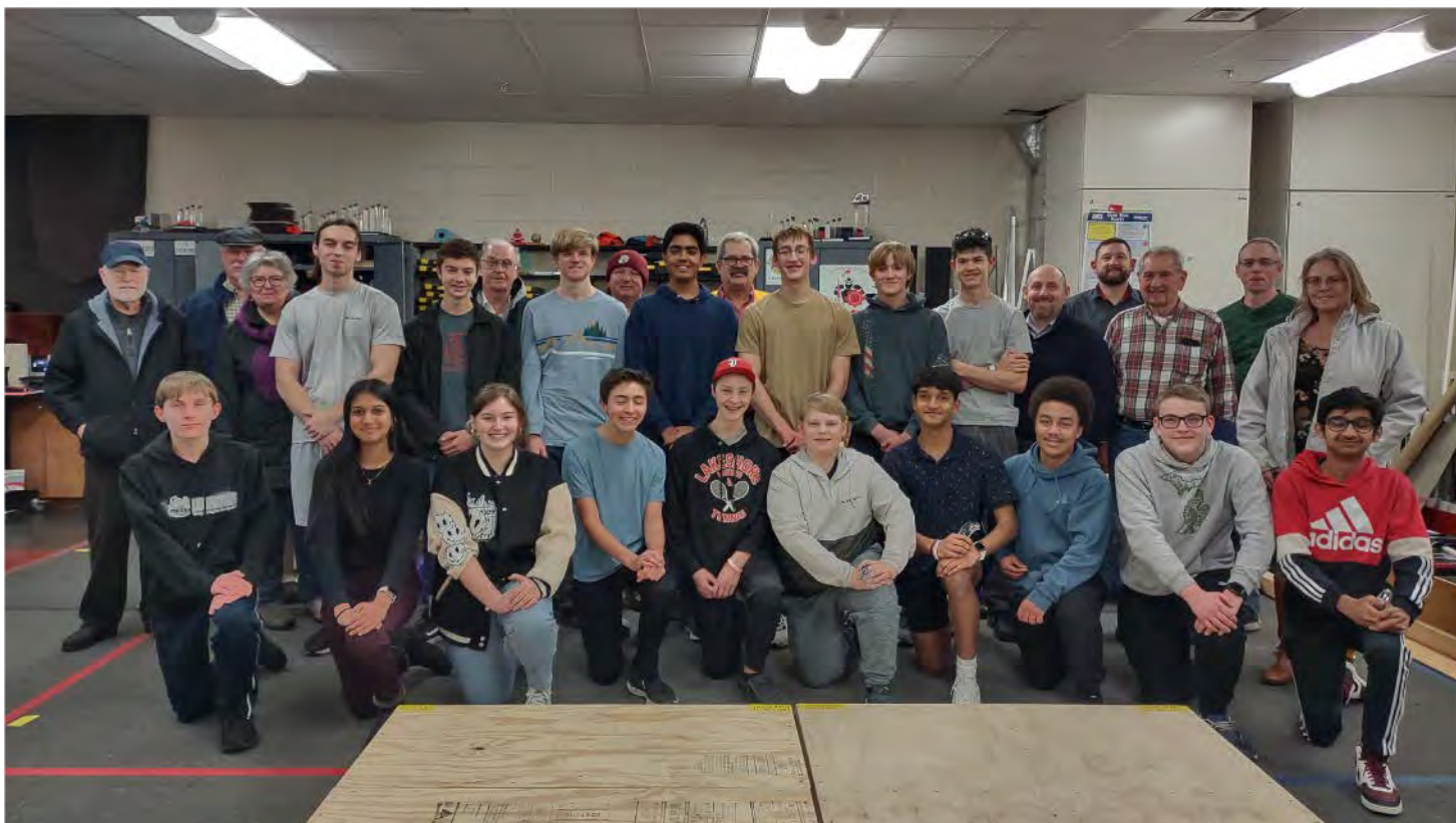
Lakeshore Lance-a-bot team with mentors and Lakeshore Lions.