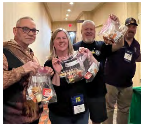
Packing snack bags for the Kids Food Basket Program