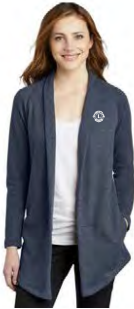
Estate Blue Heather