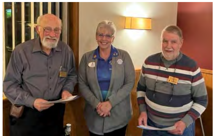
Coloma new member induction