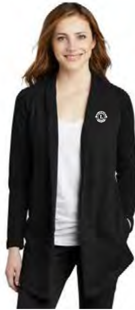
Deep Black Heather