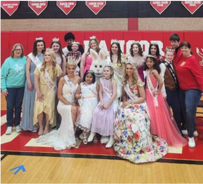
The Bangor Lions is a sponsor of the Miss Bangor Pageant Organization and the Blossomtime Festival. The court members come out to support the club, take pictures with the kids and hand out treats.