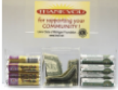
Acrylic Tray Mint Rolls