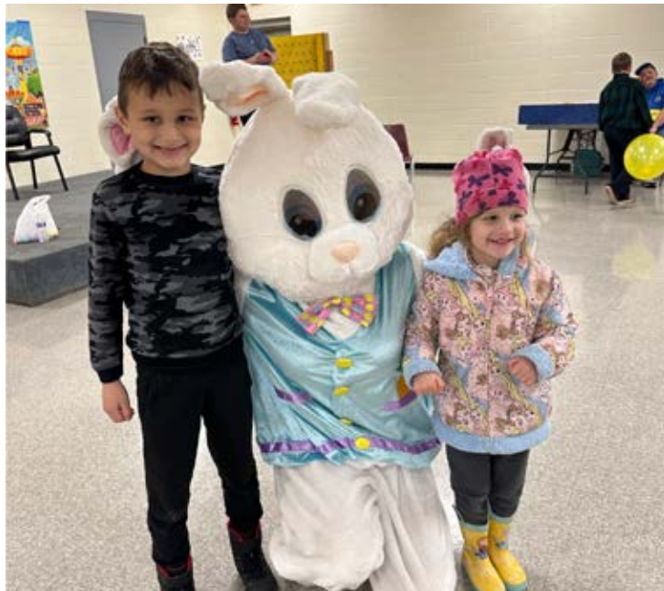
The LEOs helped the community have fun at the Mattawan Lions Spring Carnival.