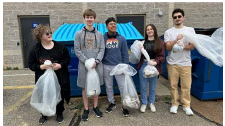
The LEO Club in combination with the Mattawan NHS cleaned up the school grounds.