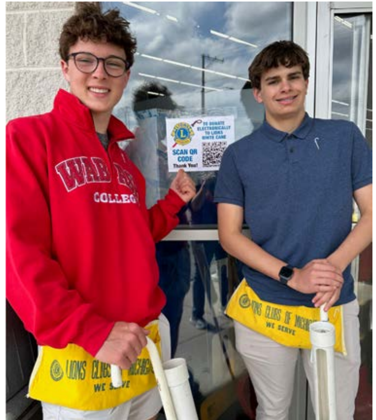
The LEOs raised $592.80 over 12 hours of soliciting for funds for White Cane. Great work!