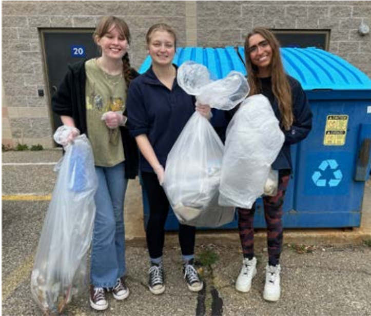
In honor of Earth Day, the LEOs did their part to beautify our school grounds.