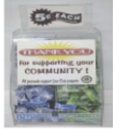
Acrylic Tray Mint Drops

Wintergreen Fizzy Fruit Peppermint 12 Pieces/Roll 576 Rolls/Case 48 Boxes/Case