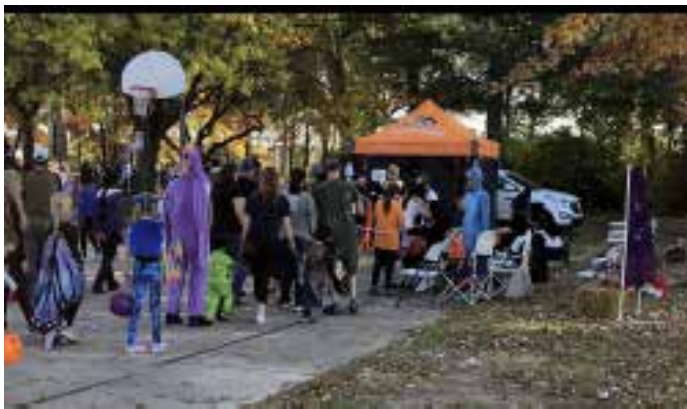
Patients lined up to be screened.

On October 22, 2022, Portage Lions Club of Michigan, held its 5th Annual Monster Mash in coordination with Portage Parks and Recreation. This is one of the service projects that the club holds each year and is much anticipated by club members and the community.