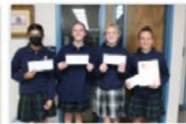
Congratulations to the 7th graders who won the local Swift Lions Club International Peace Poster competition.