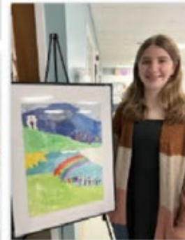
Congratulations! PCMS Art club participated in the annual Lions Club International Peace Poster contest. The theme was "Live with Compassion." Plainfield Lions Club celebrated the winner at the annual Night of Giving. ...