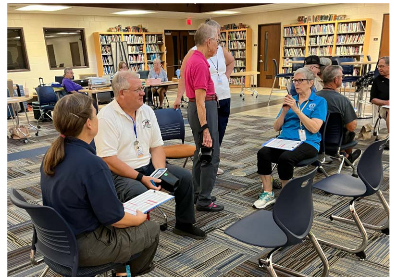
Waiting for the kiddos to show.