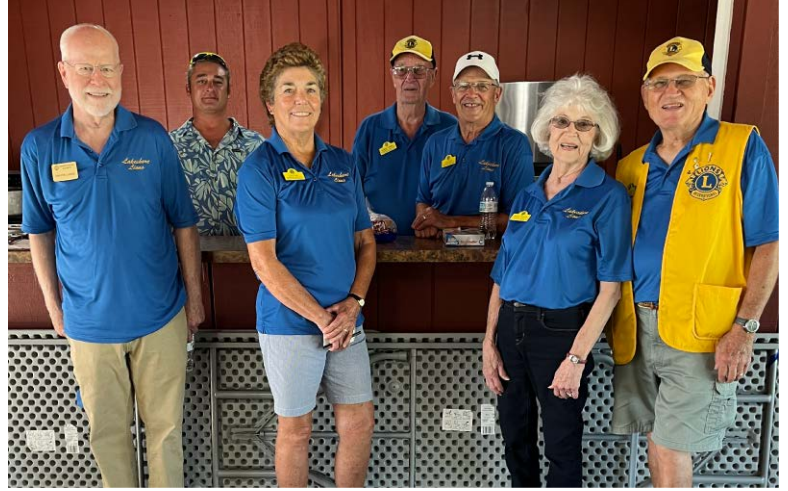
Help from the Lakeshore Lions