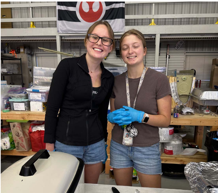
Mattawan LEO officers pitch in to help.