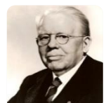
Lions Clubs Founder Melvin Jones

Contributions for the MJF can be made by individuals (including non-Lions), clubs or districts. Donations may be in one sum or in installments. Melvin Jones Fellows receive a special lapel pin, a plaque and a congratulatory letter. (Ctrl + Click to follow link) Apply Now For further Melvin Jones Fellowship contributions or inquiries, contact Donor Services at 630-203-3836.