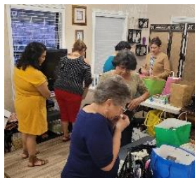
Assembling purses and chit-chatting