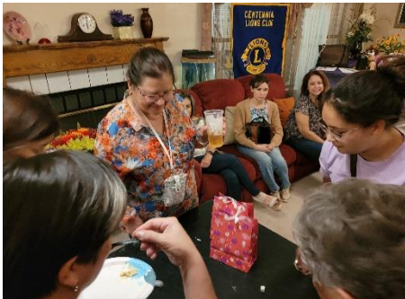
Playing games after working hard assembling purses