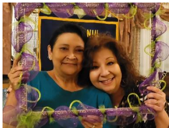
Photo frame opportunity

Thank you to all who attended and made donations.