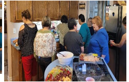
Delicious Pot Luck Dinner is served!