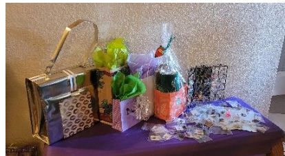
Earrings, game prizes & donation purse made out of a box