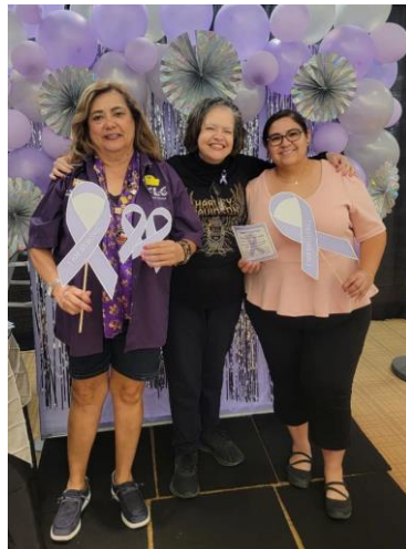
El Paso Executive Women members at the San Vicente Fun Walk

EPEWLC volunteered at Dillard's Style for a Cause on Saturday. They passed out flyers to promote the event to raise funds for the "V" Foundation to fund game-changing cancer research!