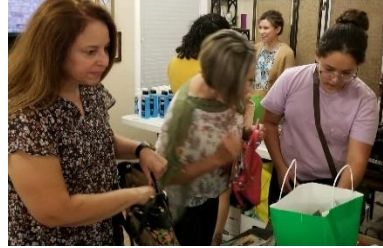
Women working together for one cause: Women Supporting Women. Filling purses with toiletries, earrings, make-up, essential and much more