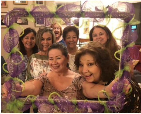
Some just being silly