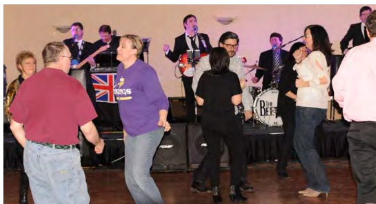
Dancing to the Beatles