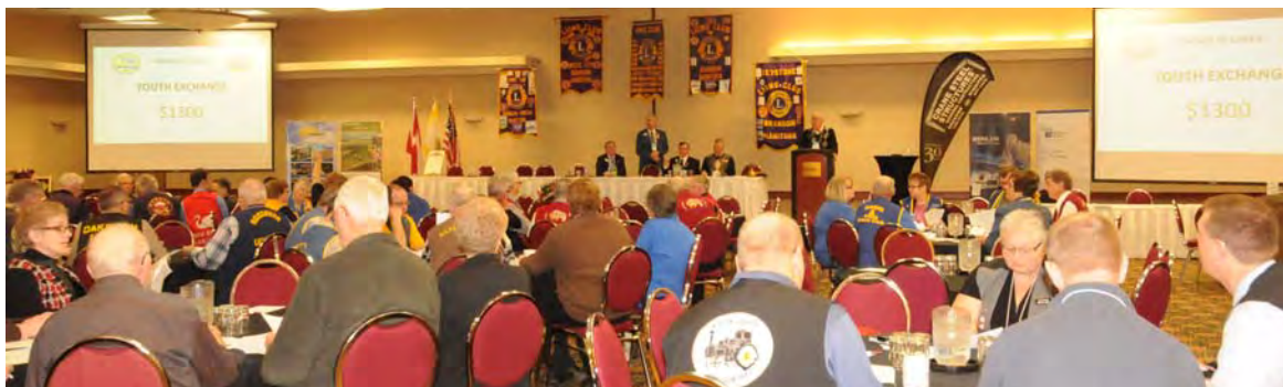
Saturday Annual Business Meeting