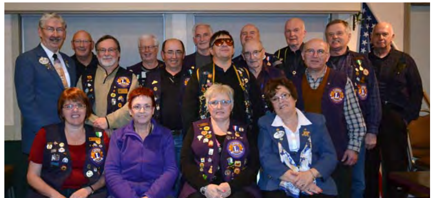
DG visit with Morden & Miami Lions.