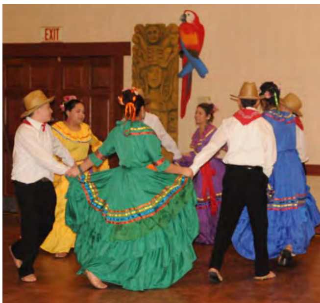
Friday Night Honduran Dancers