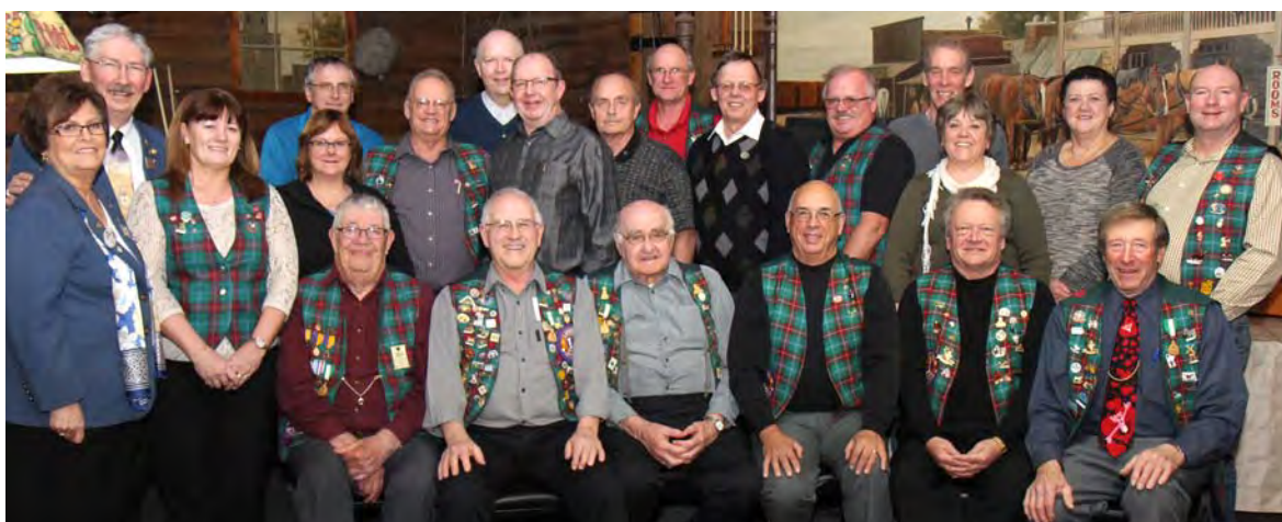
DG visit with Boishevain Lions Club