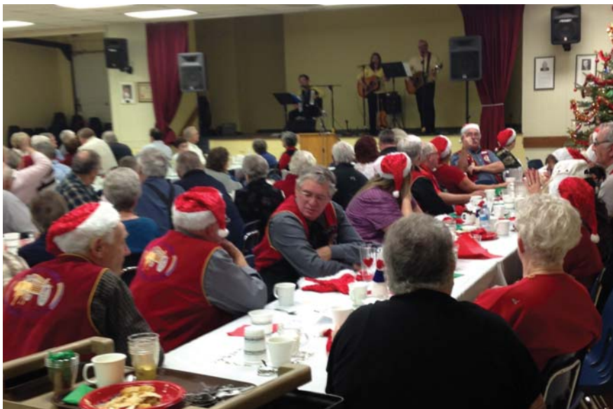
Lions and Seniors enjoy entertainment at Oak Lake Seniors Supper held on Dec. 7th.