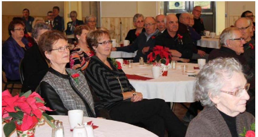
Santa's Elf visiting the Crystal City Lions Seniors Dinner.