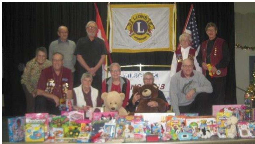
Binscarth Lions with gifts collected at their Santa Anonymous to put in hampers and presented to families in need in Inglis, Russell, Angusville, Binscarth, and St. Lazare.

The Binscarth Lions again demonstrated their willingness to serve their various community groups.