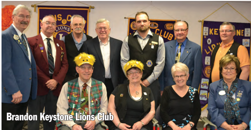
Brandon Keystone Lions Club