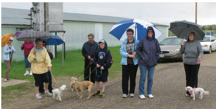
Hardy walkers make the trek through the rain for the Binscarth Lions Purina Dog Walk for guides. $850 was raised.