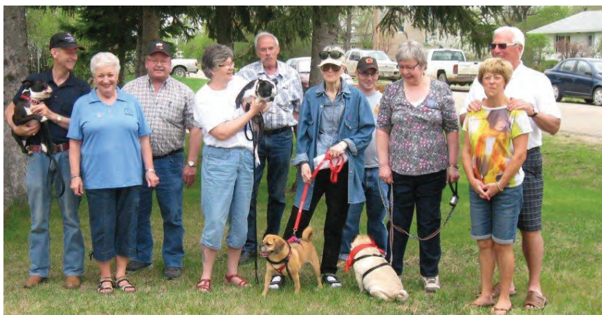
Participants & volunteers at the Lions Foundation of Canada Walk for Dog Guides held at Wawanesa on May 25, 2014. Wawanesa Lions Club raised $1160 for the Dog Guide Program.

To some these dog guides are their eyes, to others, their means to live independently. If your club did not take part this year, get more information at www.purinawalkfordogguides.com and join the steps towards independence before May 2015.