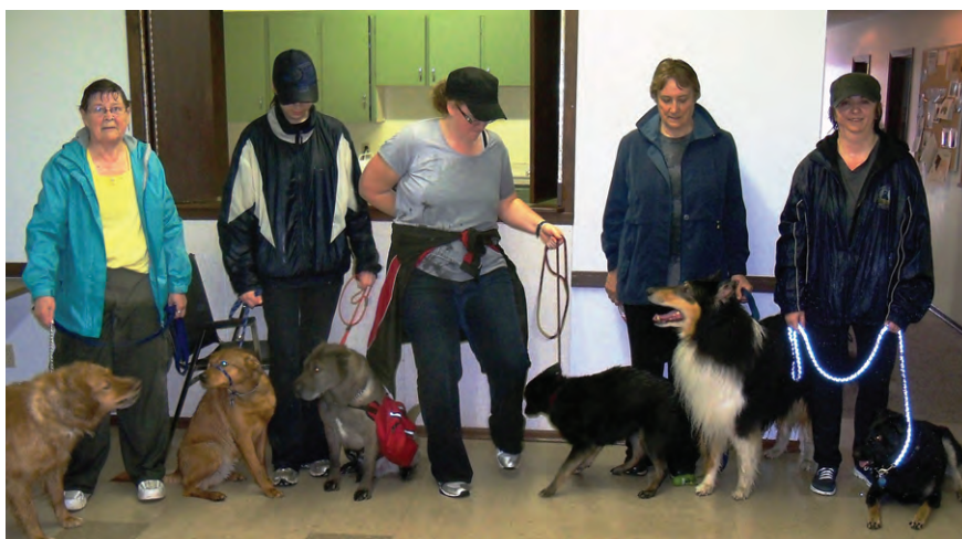
Portage Lions Club with Oakville Lions, MacGregor Lions and La Prairie Lioness worked together to organize and run our Purina Dog Walk. We had 20 people who gathered pledges, and about 17 who brought out their dogs. Pledges totalled $4,295, with about $500 in donations, which have yet to be tallied. We had almost a constant light rain and so anyone outside, walkers, dogs and some Lions got soaked.