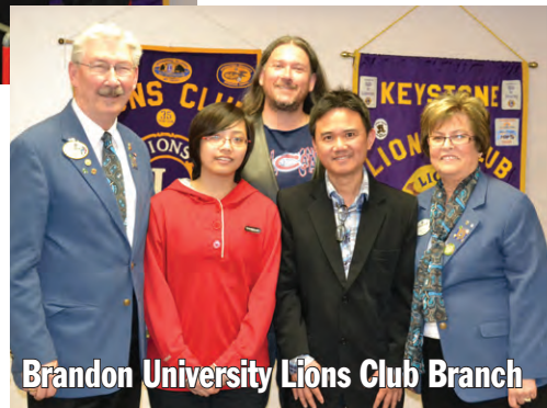
Brandon University Lions Club Branch