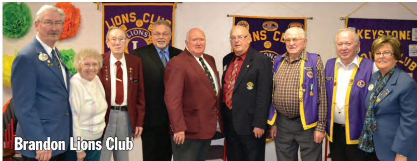
Brandon Lions Club