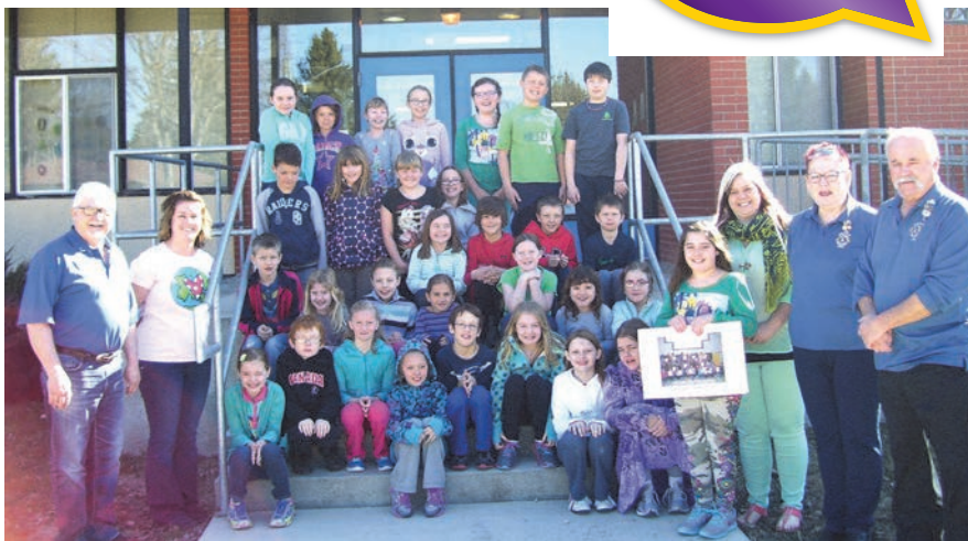
Crystal City Lions provide funding for School field Trip to Assiniboine Zoo