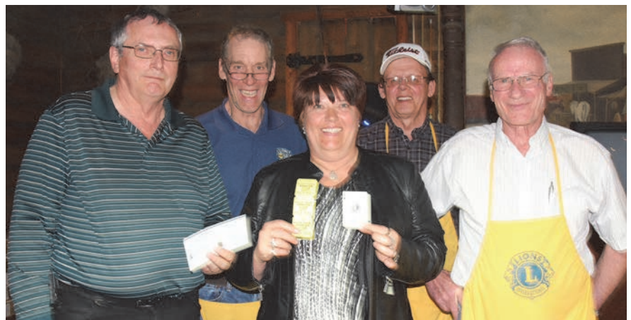
Winner claims Boissevain Lions Club Chase the Ace Cash Pot

Sponsoring Community Newsletter; Reviewing need for wheelchair ramp & medical assistance for local family; Planning 7th Annual Fiddle Festival for May 9th - Preparing to operate Prairie Dog Food Booth