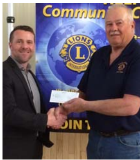
Austin Lions give donation to STARS Ambulance.

The Austin and Area Lions Club held their annual Fun Night. During the evening dinner, was served, and guests to go hear presentations from STARS, Victoria Place (an assisted living centre for seniors) and the Manitoba Agricultural Museum. Each was presented with a donation.