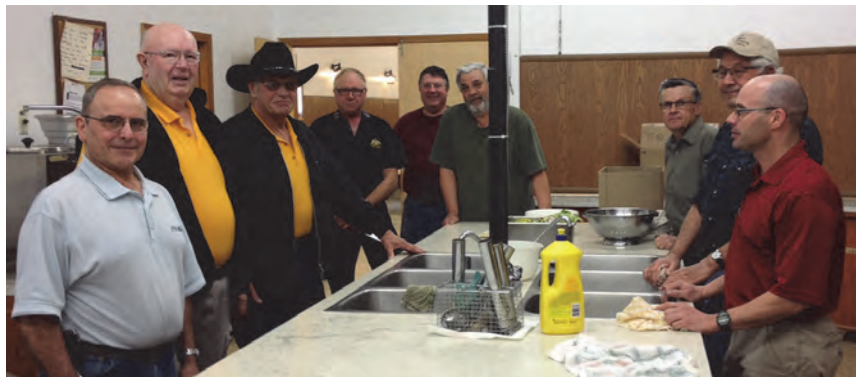
Holland & Area Lions members preparing April 4 Steak Supper at Holland.