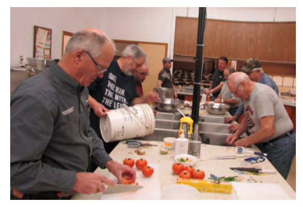
Holland & Area Lions prepare food for their annual Steak Night held April 2.

Donations at the Parade of Green to: Lions Eye Bank; Lions Foundation of MB & NW ON Medical Assistance Program; Lions Quest; Lions Foundation of Canada Dog Guides; Lions Clubs International Foundation. Donation made to Brandon Lions