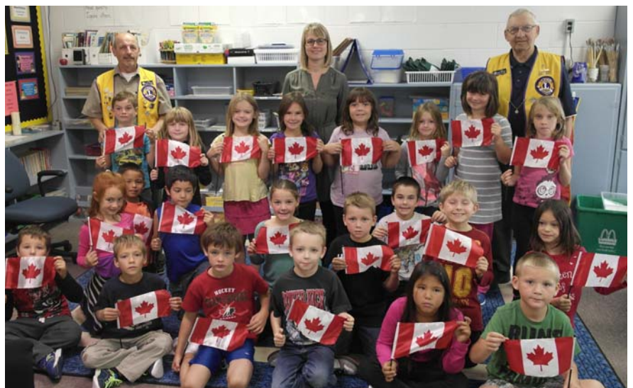
The Project Pride activity at Oakville School, sponsored by the Oakville Lions Club.