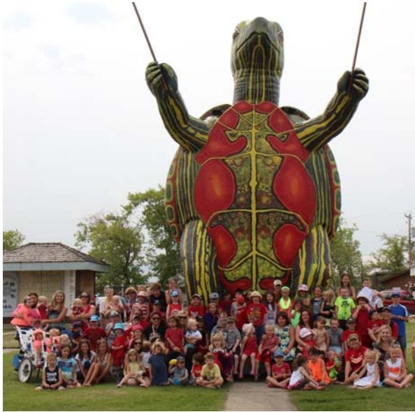
In celebration of Tommy Turtle's 40th birthday, a large group of "Turtlets" came out to start the party and have their picture taken with him on July 18th.