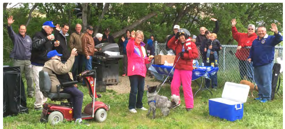
Walk for Dog Guides participants of the Minnedosa Walk held in May 2017. The walk ended at the new dog park. A total of $985 was raised.