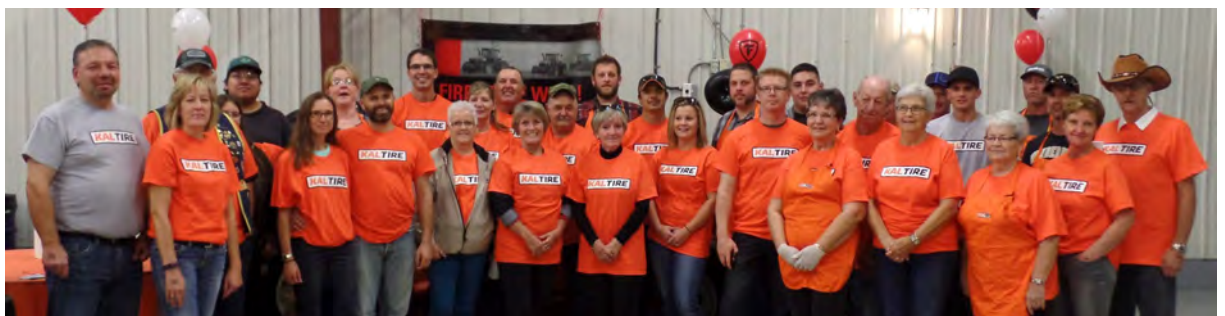
Support and sponsors, Kal Tire at this year's Bull-A-Rama BBQ