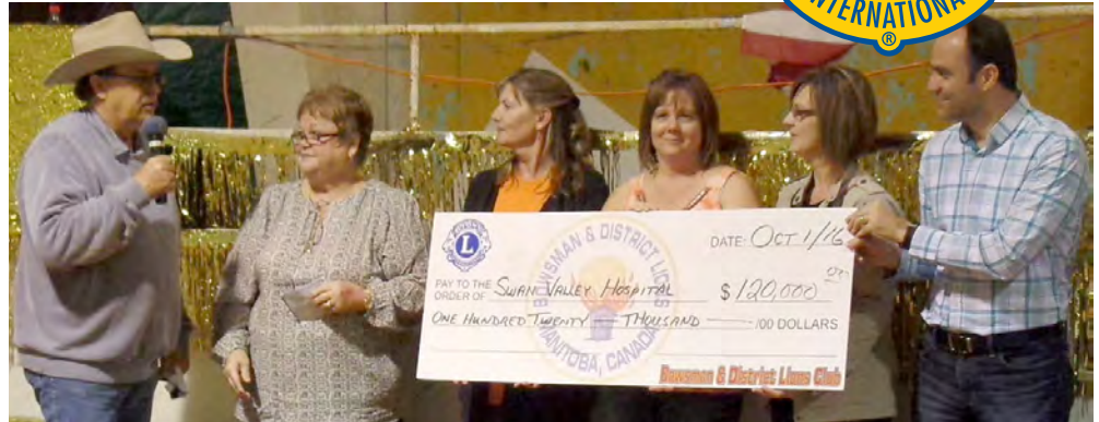
$120,000 presented to Swan Valley Health Center for Heart Monitor equipment, a joint fundraising effort of the Bowsman Lions Club.

The first "Fun"draiser Bonanza came about due to a request for help from the Swan River Golf & Country Club a few years ago. The weather had not been kind to the Golf Course for a few years. It was in financial need and our Club had been approached about a donation. We were in need of some more people to help us put on Bull-A-Rama. With the addition of the BBQ, it was now three separate events being held in two locations during harvest time. It was proposed that if they helped us with Bull-A-Rama we would help them with a fundraiser. They accepted