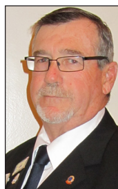
BY DISTRICT GOVERNOR OMER CHAMPIGNY