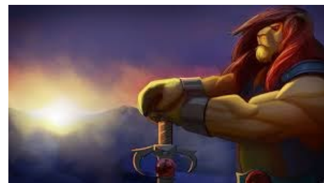
Lion-O from Thundercats

The Multiple District-3 OK Lions Directory is published in electronic form; a printed version is available to any who ask for it. It is an 8 ½" by 11" format. A District 3-H-only portion is also available. We are still building our email lists, so please help us out