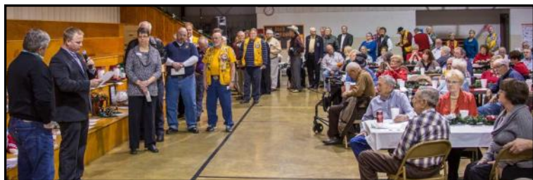
(Left) The parade of checks at the OK Lions Boys Ranch Christmas party; (Top Left) Lions attending the OK Lions Boys Ranch Christmas party; (Top Right) Members of the Red Fork Lions club at the OK Lions Boys