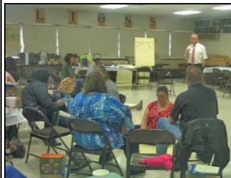
Lions Quest workshop hosted by the Oklahoma City Capitol Hill Lions club. Workshop was held Nov 11, 2013