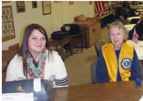
Chelsea LC Chicken Noodle Dinner