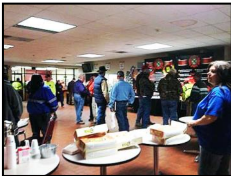
Lions serving doughnuts to the firemen at training school,