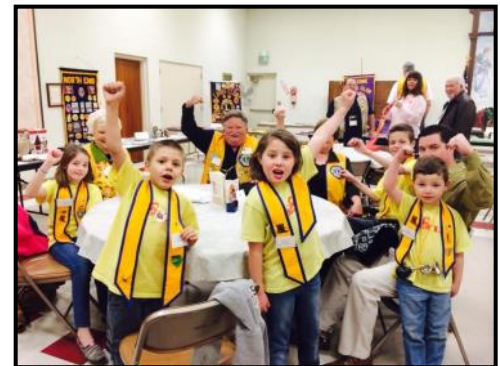
Ponca City Noon Cubbies at the 3-A District Convention.