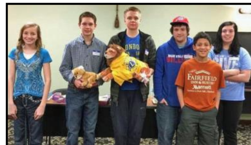
Members of the new Leo club sponsored by the Lawton Noon club