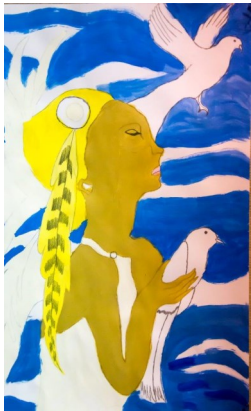
"Peace is something that keeps a person calm and feel relaxed."

If you still need training, a session will be offered at the convention on Feb. 7, or you can ask for a special training session for your club or clubs in your vicinity.