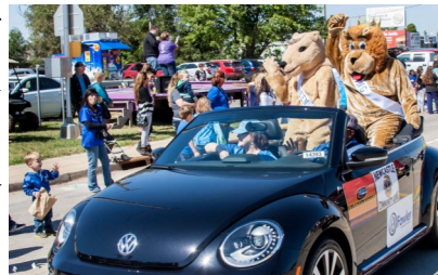
The Newcastle Community Lions Club participating in Newcastle's Homecoming Parade

Thank you to the clubs who've invited me to visit this past six months; I need to contact many of you to set up official visits for the first three to four months of 2015.