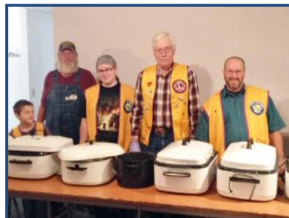
Kremlin Lions Club pancake supper with busy Lions.

Hennessey: Lions gathered donations from area businesses to fund Mistletoe Magic gift certificates to be used at Hennessey Merchants. Lions sacked up candy to be given to children when they visit Santa.