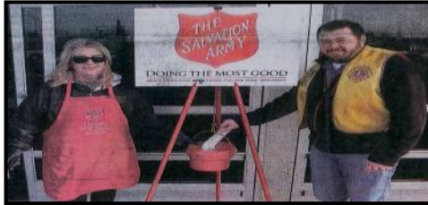
Hugo Lions ring the bell for Salvation Army

Hugo: Sponsored Christmas bazaar/auction as their big fundraiser for the year. They are working hard to recruit new members. Their weekly program is always in the newspaper to help with community awareness of Lions presence, projects, and activities.