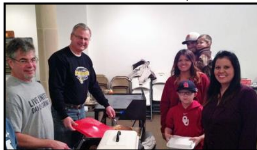
Marlow Lions hosted the annual Lions Pancake Breakfast in conjunction with the Chamber of Commerce Christmas parade.

Marlow: On Dec. 6, Lions hosted the annual Lions Pancake Breakfast in conjunction with the Chamber of Commerce Christmas parade.