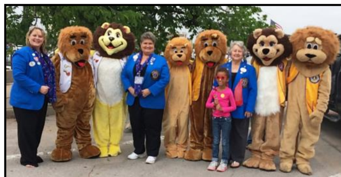
Lions State Convention - Leo wearing the Lions costumes for the Arms Forces Parade

Thank you for serving us as we serve them. We are better together.