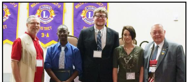
Speech Winners Contestant winners at the Oklahoma Lions State Convention.