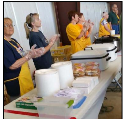
Members of North Enid, Garber, and Pioneer Pleasant-Vale Lion clubs help serve veterans and their families for Memorial day.