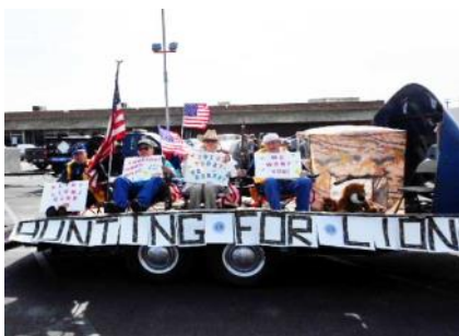
Altus Lions "Hunting for Lions" in the Armed Service Day parade.