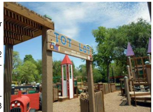
The playground Cordell Lions built—quite possibly the coolest playground ever! (and it is in Lions Park)

Thanks to all of you—it's been a great year!