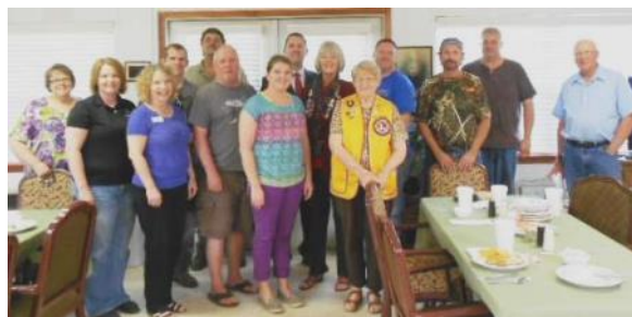
Cordell Lions Club