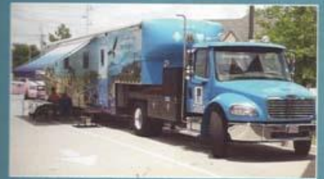
The Oklahoma Lions Mobile Health Screening Unit offers free blood sugar, bone density and general health screening statewide.

As the Oklahoma Lions Service Foundation looks to the future, planned giving has become essential to ensuring that the organization's support continues for generations. Through the organization's legacy giving program, they are encouraging members to consider giving to the organization's endowment fund and work with the Oklahoma City Community Foundation on their estate plans.