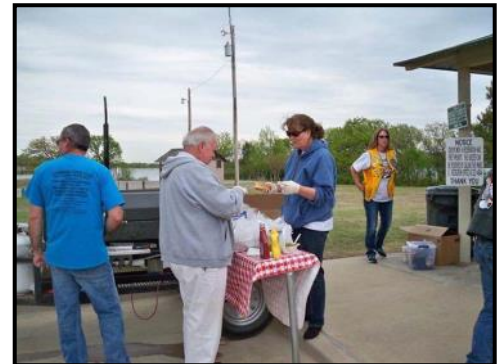
Ardmore Lions Club held their annual Poker Run

Coalgate -All seniors from Coalgate and Tupelo High Schools were fed, and Coalgate Lions Scholarships were announced.