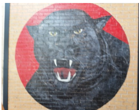
This wall was the only thing standing after the tornado hit Plaza Towers. Thanks to a campaign by the students, the wall was saved and included

At Plaza Towers, we visited the Plaza where the memorial for the seven children killed in the storm will be located. The Disaster Relief Committee has