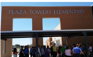
The Plaza Towers Memorial Site