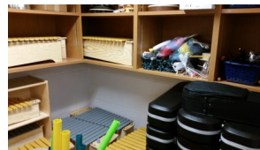
Musical Instruments courtesy of the Lions

At Briarwood, we had the opportunity to visit the Music Room where the Lions of