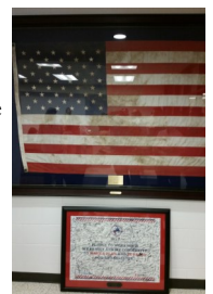
This flag from Briarwood Elementary was recovered some distance away, and now resides in the new office.

many moments that served as reminders of the tragic events of the storms, mostly this was an upbeat reminder of the importance of being a part of a community. It brings into sharp focus why We Serve!