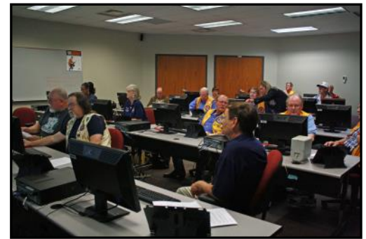
Club officer training in Chickasha