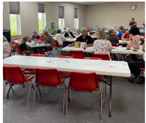
Auction crowd getting ready for the next item.