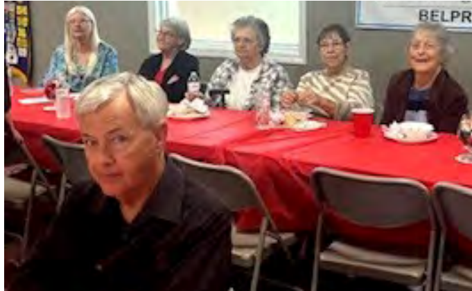
Our local Women's Club are great supporters at our activities whenever they can. Appreciate them so much.