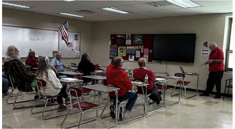
Lions attending different sessions at the Leadership School .

Over 60 Lions came out to participate in our district leadership school, and learned more about Lions!