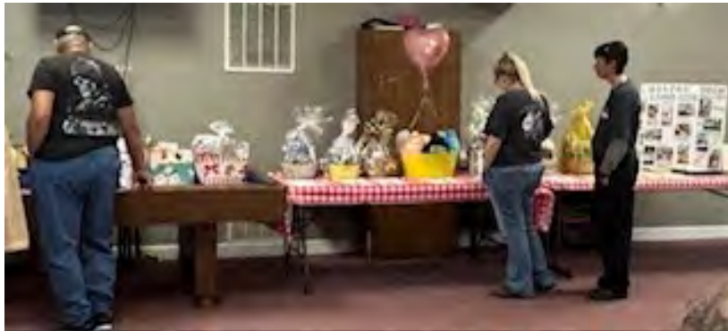
Some of the attendees checking out the auction items to bid on!