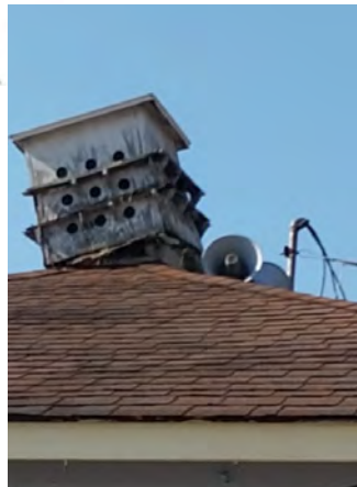
The old birdhouse goes bye bye