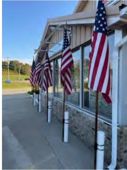
Lion Kevin Wechter showing how beautiful our flag really is.