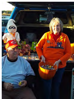
Lots of kids lined up to get their goodies from the Hebron Lions Club!