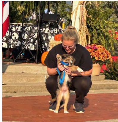
ABSO Doggie of the Year! "COMPASS"

Another first was the FAITH and BLUE program. It consisted of area churches and our Local Police departments. (City and Township) coming together to let our community know they are here to help and work together .They had a very moving presentation.