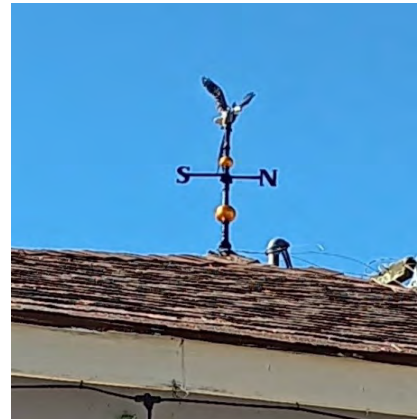
The new weathervane that replaced the old birdhouse .